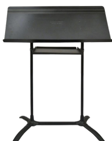
CONDUCTORS & DIRECTORS