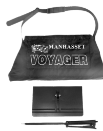
MUSICIANS ON THE GO