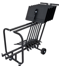
STORAGE & TRANSPORT